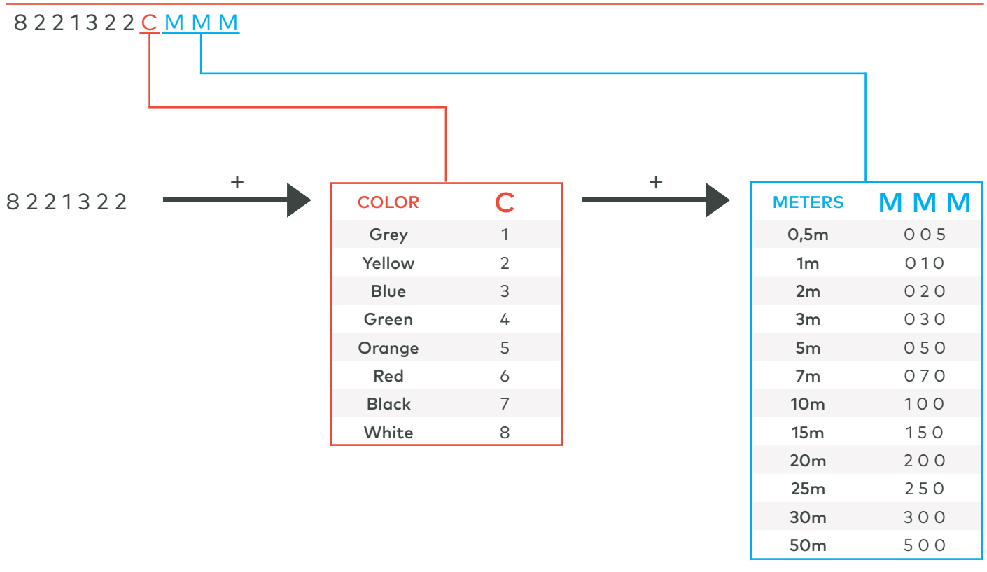
PART NUMBER BREAKDOWN - ORDER INFORMATION

• GREY (RAL7035); • YELLOW (RAL1018); • BLUE (RAL5017); • GREEN (RAL6016); • ORANGE (RAL2008); • RED (RAL3028); • BLACK (RAL9005).