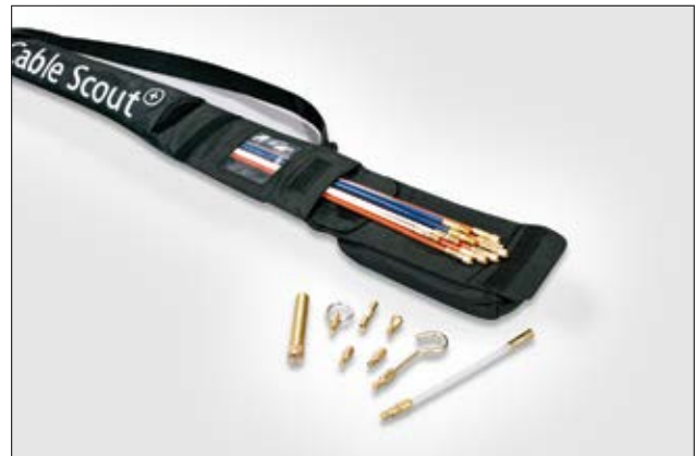
All components stored neat and tidy with the Cable Scout+ Deluxe set.