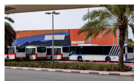
For use in depots