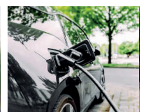
For public parking lots