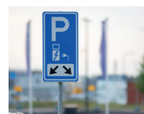
For highway use