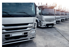
For all types of electric trucks