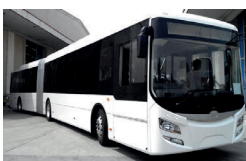
For all types of electric buses